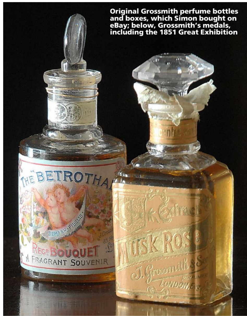
Original Grossmith perfume bottles and boxes, which Simon bought on eBay; below, Grossmith's medals, including the 1851 Great Exhibition